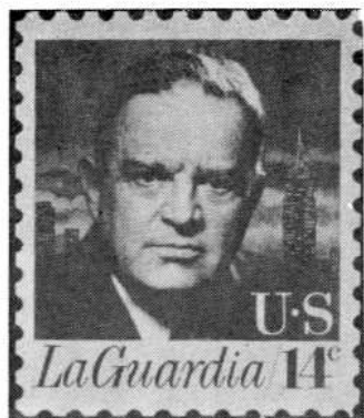
Fiorello H. LaGuardia