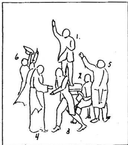
Fragment of the painting.

The Masonic details were located in the well known book "Une Loge Maconnique d'avant 1789" by Louis Amiable. (Paris 1897).