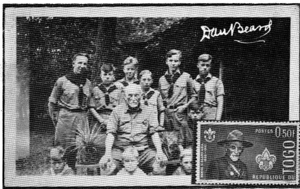
Daniel Carter Beard (1850-1941)

Organizer of the United States Boy Scouts. He was raised on November 30th, 1917 in Mariners Lodge No. 67 of New York City and later became a member of Cornucopia Lodge No. 563 of Flushing, New York. In 1938 Daniel Carter Beard was the recipient of the Grand Lodge of New York's Medal for Distinguished Achievement. He was a Master of Woodcraft.