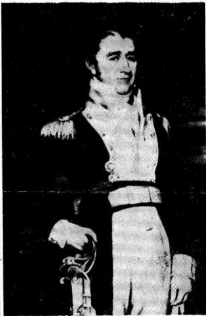
Right—Governor DeWitt Clinton, Grand Master of Masons of New York 1806-1819 and during War of 1812; also Mayor of New York City and Governor of the state. Left—General Lewis Morgan of the War of 1812—Grand Master of Masons of the State of New York 1830-1843.