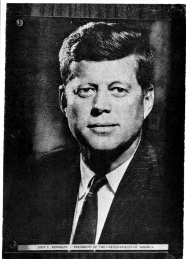
JOHN F. KENNEDY - PRESIDENT OF THE UNITED STATES OF AMERICA