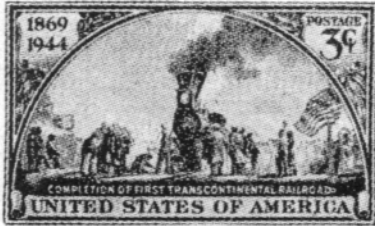
U.S. No. 922

Leland Stanford, capitalist and philanthropist, is known as the founder of Leland Stanford Junior University at Palo Alto, California. He was born March 9, 1824, at Watervliet, New York, received a common school education, studied law and was admitted to the bar in 1849.