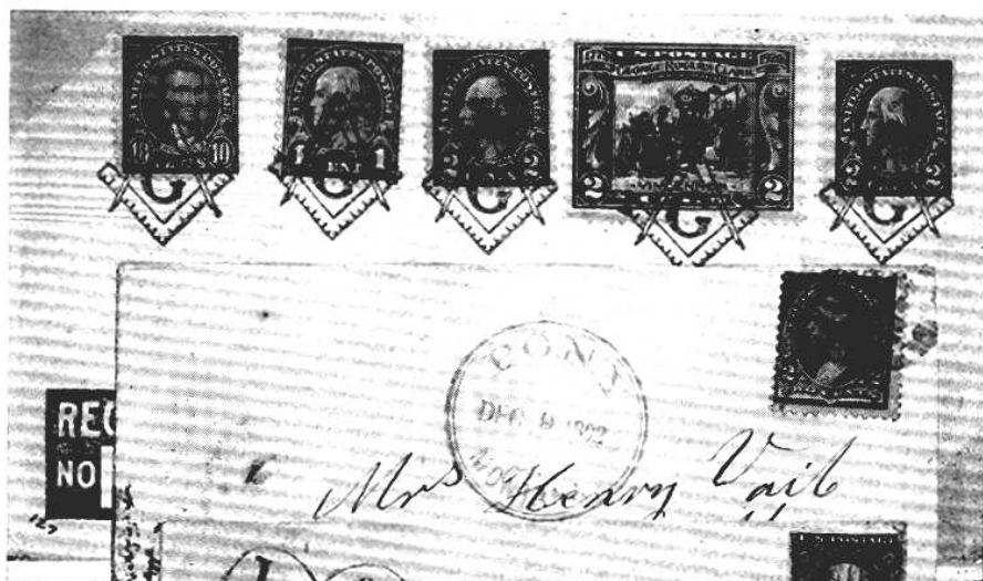
The Masonic cancellations on the above cover are especially interesting as they are of somewhat late vintage, when such cancellations are contrary to postal regulations.

He then gathered together another quantity of sticks, one for each child and tying them compactly into a bundle, he asked them to help him break it. This they could not do as the stout bundle resisted all efforts and thus he showed them that in Union there is Strength. Hence there appears upon the thongs or bands holding together the Fasces on our State Seal, the words "Union and Constitution."