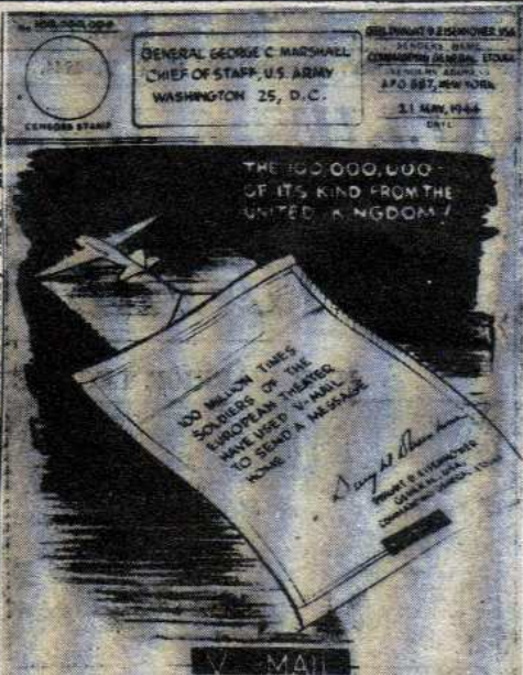
This was the note sent by Gen. Dwight D. Eisenhower to Gen. George C. Marshall to mark the 100,000,000th message sent to this country from soldiers in the European theatre of operations.