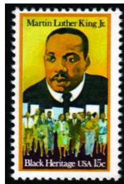
Dr. King, the first “posthumous” Freemason.

Numerous honors are bestowed posthumously by governments, even Medals of Honor; and let me draw a little parallel here with the lamb-skin apron—it is our “Medal of Honor.”