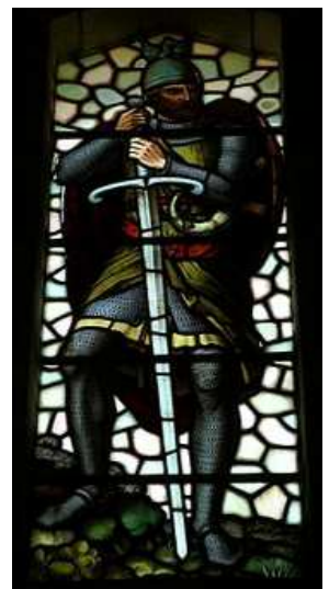
William Wallace, better known as "Braveheart."

I firmly believe that the little square was purposely engraved and buried by an early stone mason who was a Freemason for the purpose of being remembered. As you read this paper, I am sure you imagined a man working on the bridge foundation and at one point quietly reaching into his pocket, taking out the square, and tapping it point first into the clay (hardpan), then placing a large square stone (ashlar) on the spot. He likely said a little prayer in the process and then carried on with his work. He thought about the square every time he looked at the bridge in the years to come. So, yes, ancient Brother we remember you; one of your arrows found the dust.