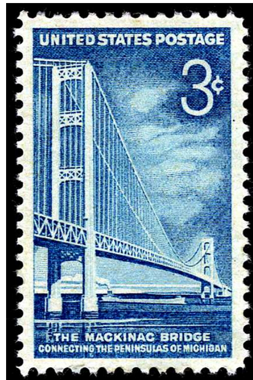
First US postage stamp depicting the bridge. It was issued in June 1958.

ber 1936. He then served in the United States Senate from November, 1936 to January 1943. He was chairman of the U.S. Senate Committee on Claims in the 77th Congress and also a member of the Banking and Currency Committee. In this capacity, he was instrumental in helping Franklin D. Roosevelt achieve his desired wage and farm price controls. He passed away on December 19, 1973 in Saint Ignace at the age of 84 and is interred there at Lakeside Cemetery.